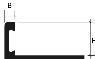
Brass B = 3 mm