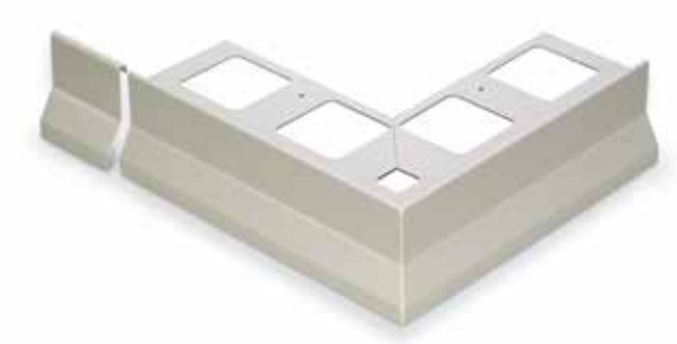
Example of external connection plus joining piece