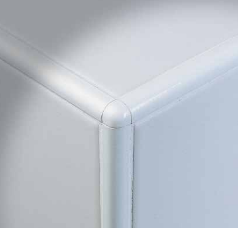
Wall detail of a corner joint between ROUNDJOLLY® trim profiles and ROUNDCAPSULE endcap.

Other applications may be: top skirting finish (as seen in diagram) or edging of tile covering, natural stone or limestone as well as for moquette carpeting.