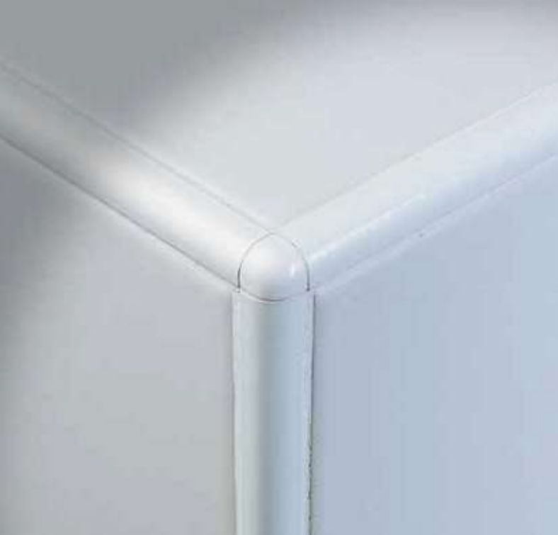
Wall detail of a corner joint between ROUNDJOLLY trim profiles and ROUNDCAPSULE endcap.

Other applications may be: top skirting finish (as seen in diagram) or edging of tile covering, natural stone or limestone as well as for moquette carpeting.